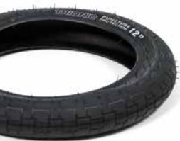
Trionic Primera Tyre with Puncture Protection

12 x 2.2" (310 x 57 mm) 14 x 2.2" (360 x 57 mm)