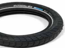
Schwalbe Big Apple Tyre with Puncture Protection

12 x 2.00" (310 x 50 mm) 14 x 2.00" (360 x 50 mm)