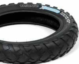
Trionic X-Country Tyre with Puncture Protection

12 x 2.2" (310 x 57 mm) 14 x 2.2" (360 x 57 mm)